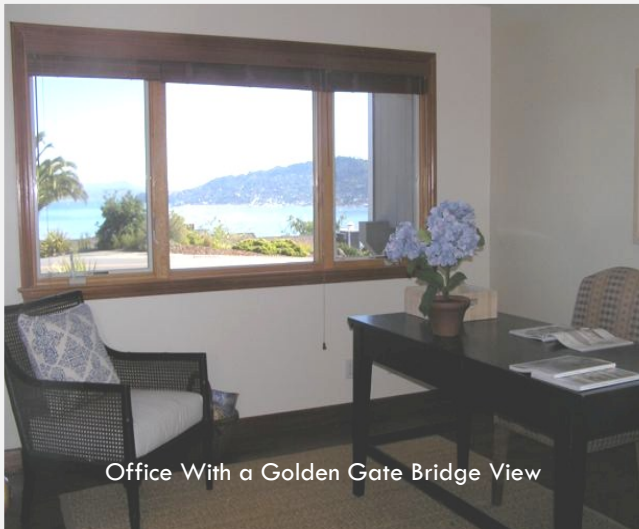
Office With a Golden Gate Bridge View