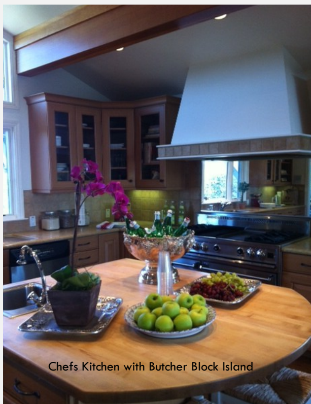
Chefs Kitchen with Butcher Block Island