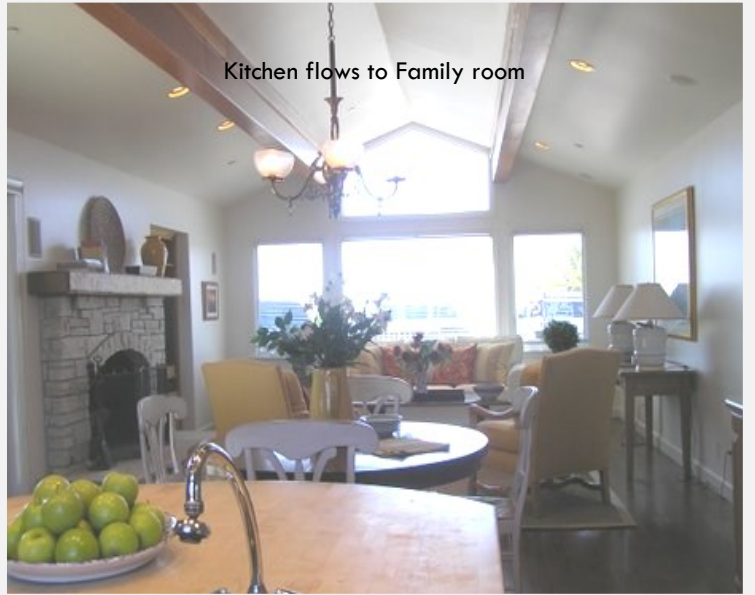
Kitchen flows to Family room