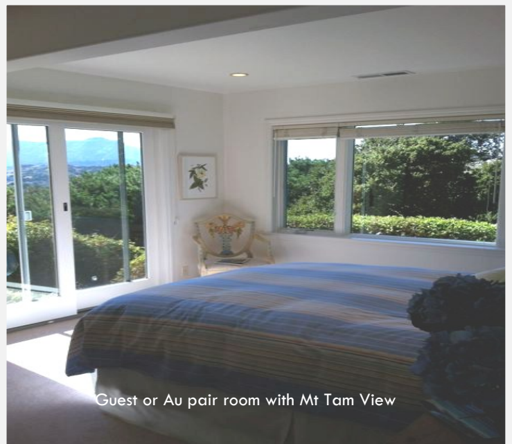
Guest or Au pair room with Mt Tam View